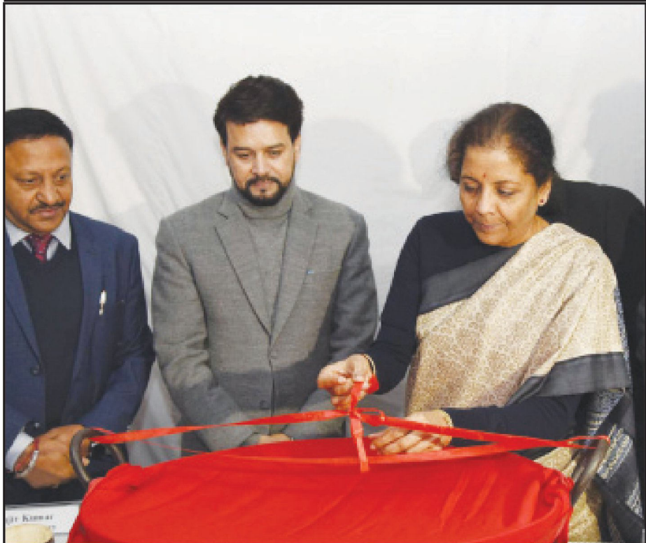
The Union Minister for Finance and Corporate Affairs, Smt. Nirmala Sitharaman at the Halwa ceremony to mark the commencement of Budget printing process for Union Budget 2020-21, in New Delhi. The Minister of State for Finance and Corporate Affairs, Shri Anurag Singh Thakur and other dignitaries are also seen.