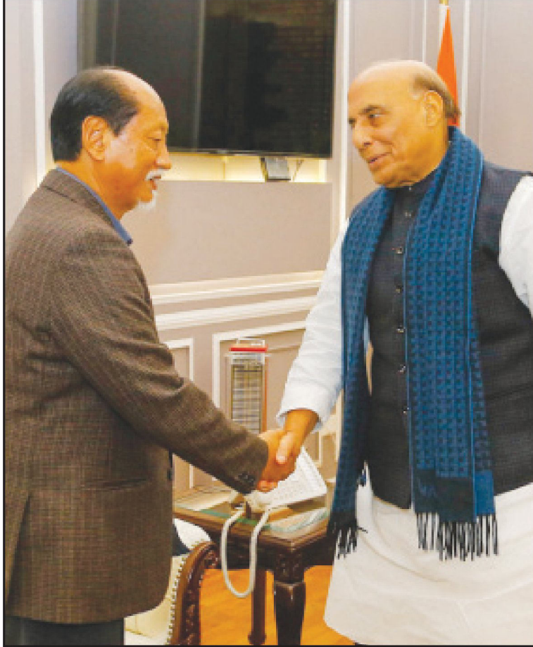
The Chief Minister of Nagaland, Shri Neiphiu Rio calling on the Union Minister for Defence, Shri Rajnath Singh, in New Delhi.