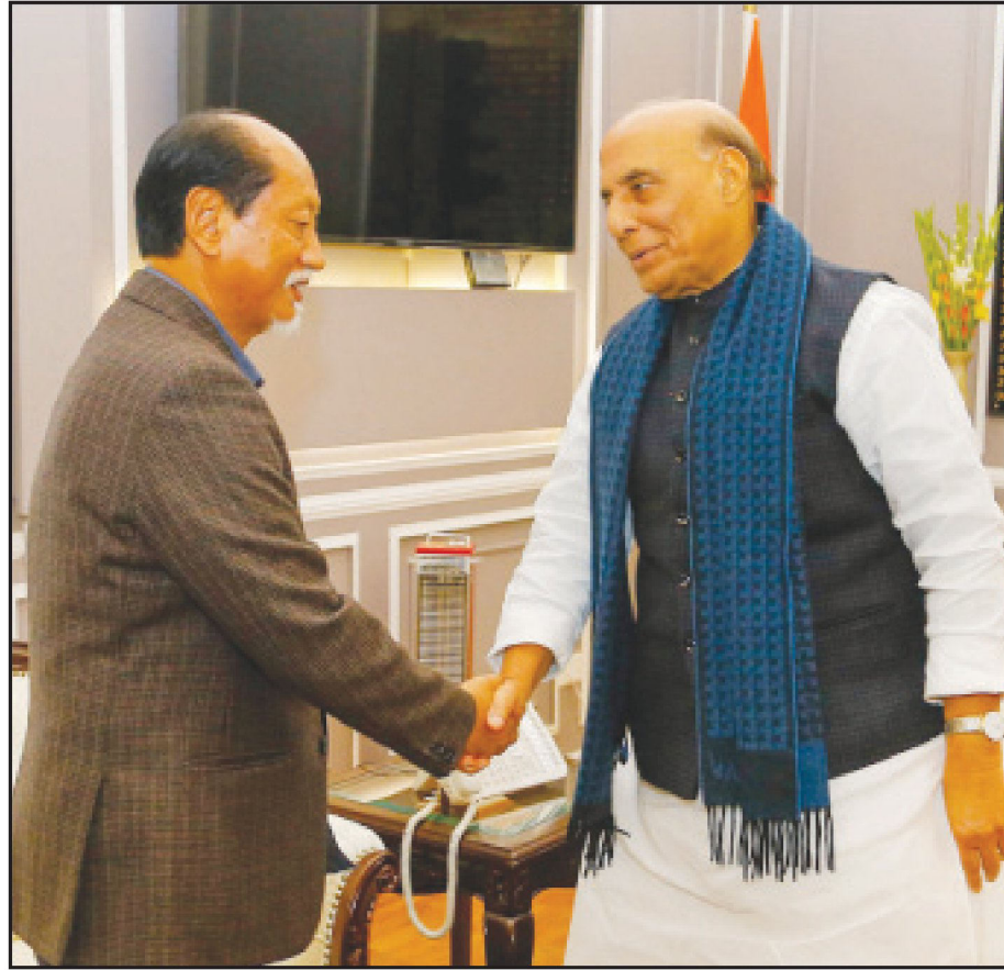
नागालैंड के मुख्यमंत्री श्री नीफियू रियो ने नई दिल्ली में केन्द्रीय रक्षा मंत्री श्री राजनाथ सिंह से मुलाकात की।

सम्मिलित थे। प्रतिनिधिमंडल की शिकायत का संज्ञान लेते हुए मुख्य चुनाव आयुक्त श्री सुनील अरोड़ा ने समुचित कार्रवाई का आश्वासन दिया। केन्द्रीय मंत्री श्री हरदीप सिंह पुरी ने कहा कि 17 जनवरी को अपने निर्णय में माननीय उच्च न्यायालय ने जितेंद्र सिंह तोमर को अपनी शिक्षा को लेकर झूठी जानकारी देने का दोषी माना था। अब वोट बैंक की लालच में आम आदमी पार्टी ने फर्जी डिट्टी मामले में 2015 में गिरफ्तार हो चुके जितेंद्र सिंह तोमर को फिर से टिकट देकर निम्न स्तरीय राजनीति की भी पराकाष्ठा पर कर दी है। आम आदमी पार्टी में एक नहीं बल्कि ऐसे 15 लोग हैं जिनपर गंभीर आरोप हैं जो साबित भी हुए हैं लेकिन उन्हें विधानसभा चुनाव के लिए टिकट भी दिया गया है। ऐसा कर के आम आदमी पार्टी ने जनता के भरोसे का मजाक बनाया है। पूर्व केन्द्रीय मंत्री व राज्यसभा सांसद श्री विजय गोयल ने कहा कि जितेंद्र सिंह तोमर को 2015 में दिल्ली सरकार में कानून मंत्री बनाया गया था लेकिन जुलाई उन्हें दिल्ली पुलिस ने फर्जी डिट्टी के मामले में गिरफ्तार किया था। यही वजह थी कि कानून मंत्री के पद से जितेंद्र सिंह तोमर को इस्तीफा देना पड़ा था। ये सब जानते हुए भी आम आदमी पार्टी ने जितेंद्र तोमर को फिर से विधानसभा चुनाव के लिए टिकट देकर साबित कर दिया है कि आम आदमी पार्टी भ्रष्ट विधायकों वाली पार्टी है जिसमें फर्जी लोगों को वरीयता दी जाती है। (प्रे.वि) teamcait0115@gmail.com