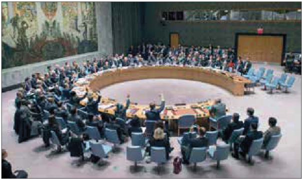
UN Security Council