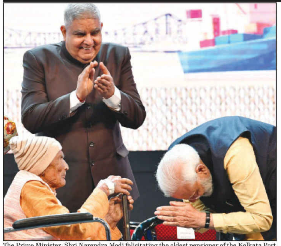
The Prime Minister, Shri Narendra Modi felicitating the oldest pensioner of the Kolkata Port Trust-105 years old Shri Nagina Bhagat for his contribution towards the Kolkata Port Trust, in Kolkata, West Bengal. The Governor of West Bengal, Shri Jagdeep Dhankhar is also seen.